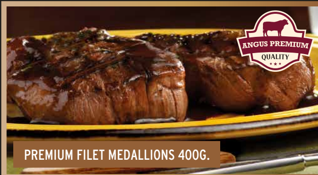
PREMIUM FILET MEDALLIONS 400G.