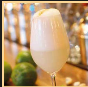
PISCO SOUR CATEDRAL