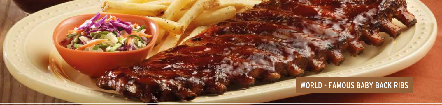
WORLD - FAMOUS BABY BACK RIBS