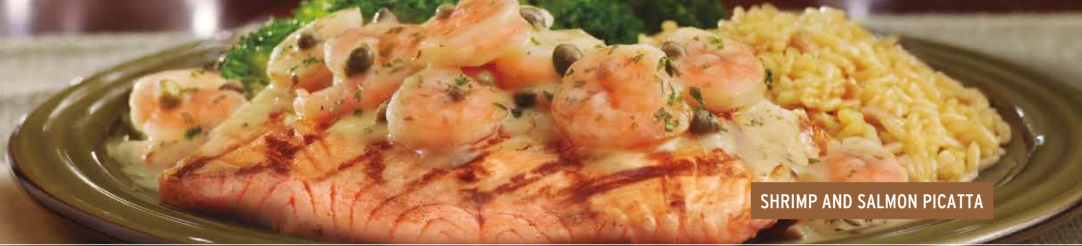
SHRIMP AND SALMON PICATTA