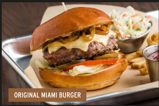
ORIGINAL MIAMI BURGER

CRISPY CHICKEN BURGER $11.990 Crispy chicken breast coated in Nashville sauce. Served with tomato, lettuce, red onion, jalapeños, pickles, cheddar cheese, and bacon.