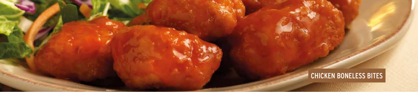
CHICKEN BONELESS BITES