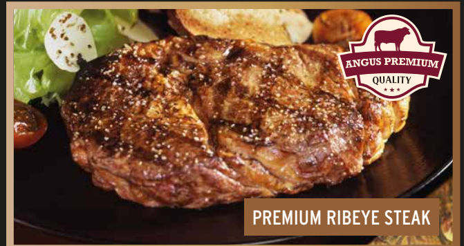
PREMIUM RIBEYE STEAK

200g option · $12.990 400g option · $19.990