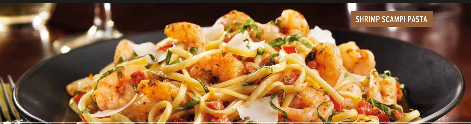
SHRIMP SCAMPI PASTA

CHEESE BURGER $9.990 Angus burger with double cheddar cheese. Add extra bacon for: $990