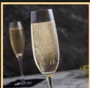
SPARKLING WINE VIÑAMAR