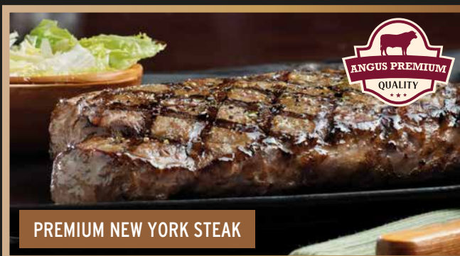
PREMIUM NEW YORK STEAK

RIBEYE STEAK $16.990 300g ribeye grilled.